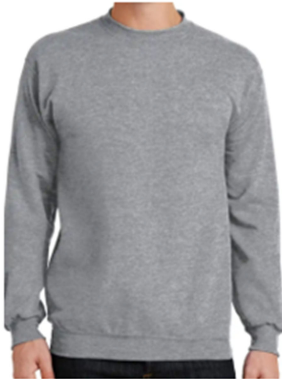
Port & Company® Sweatshirt PC78 Athletic Heather