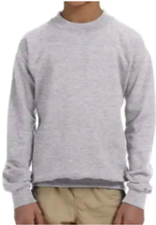
Gildan Youth Sweatshirt G1800B Sport Grey